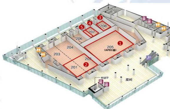
Floor Plan- BEXCO 2F